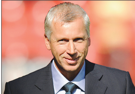
PROUD BOSS: Southampton's Alan Pardew