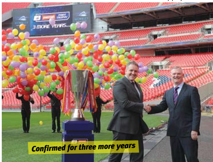
Confirmed for three more years