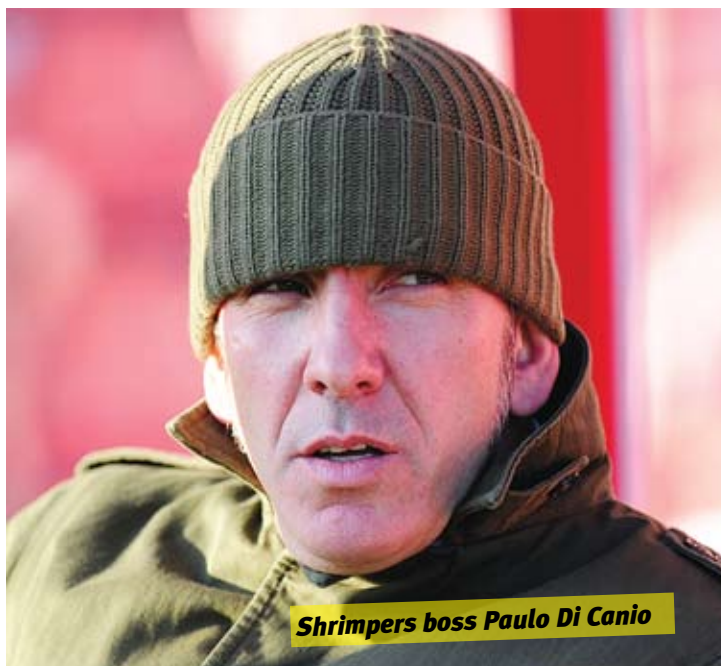
Shrimpers boss Paulo Di Canio